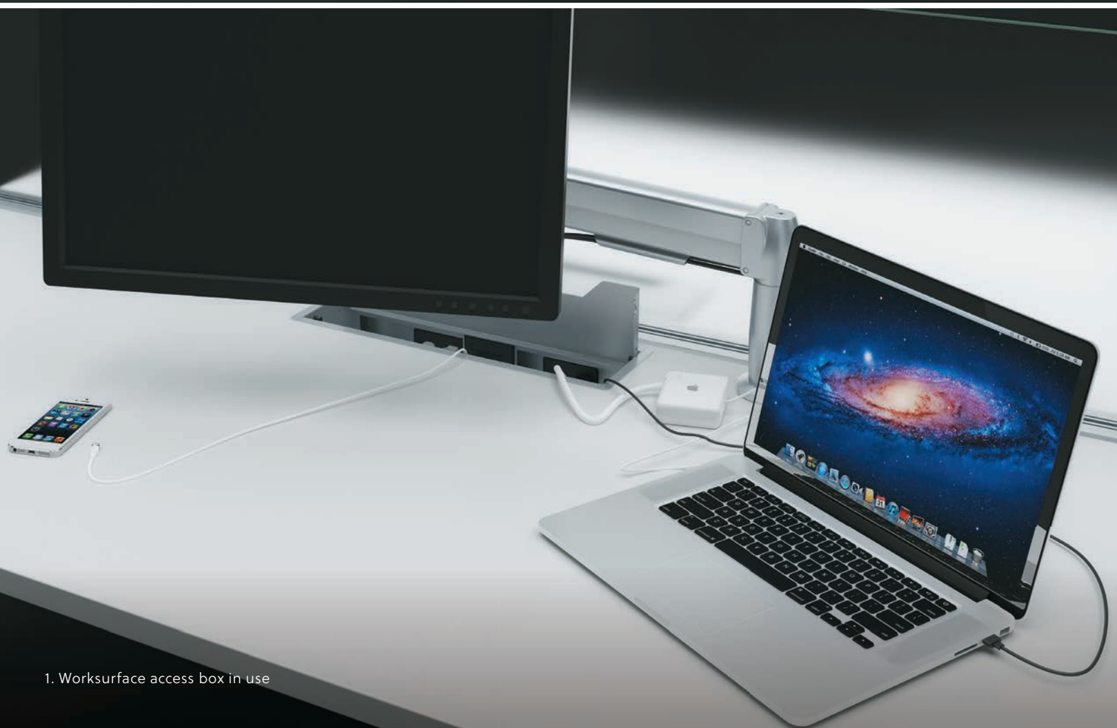
1. Work surface access box in use